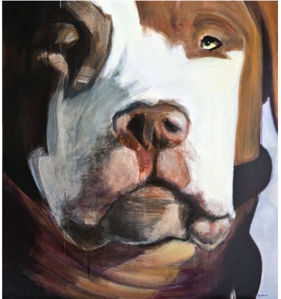
Now is the time, do not be afraid 2009 acrylic on board 120 x 110 cm