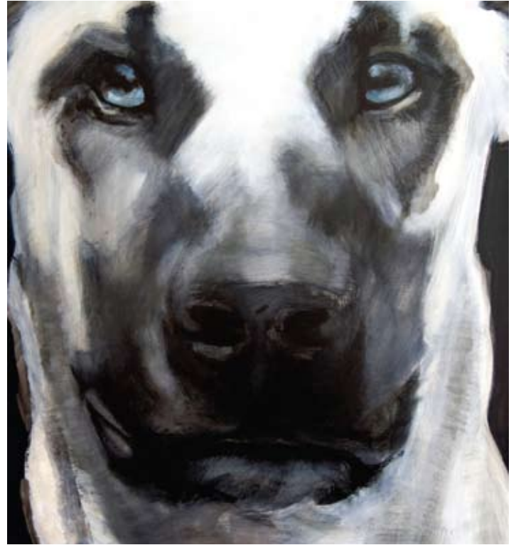
She takes nothing for granted 2007 oil on board 120 x 110 cm