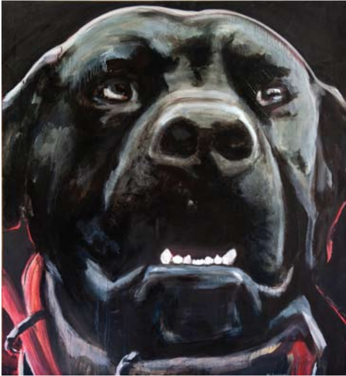
Not going down without a fight 2009 oil over acrylic on board 120 x 110 cm