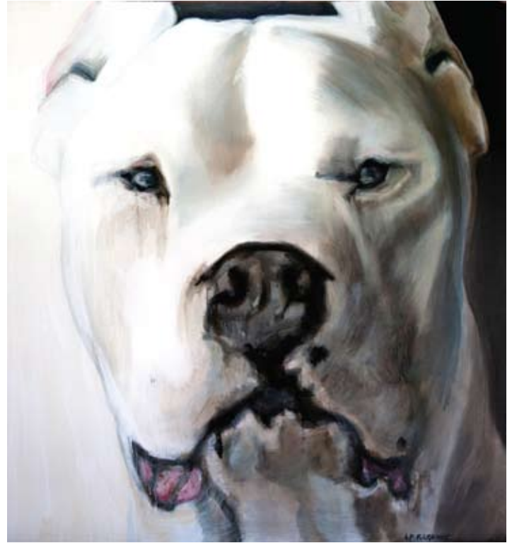
You've got to be crazy, you've got to have a real need 2009 oil on board 120 x 110 cm