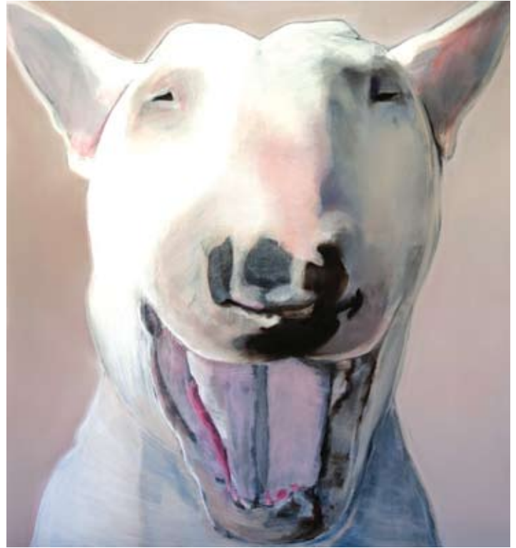
What were you thinking? 2009 oil on board 120 x 110 cm