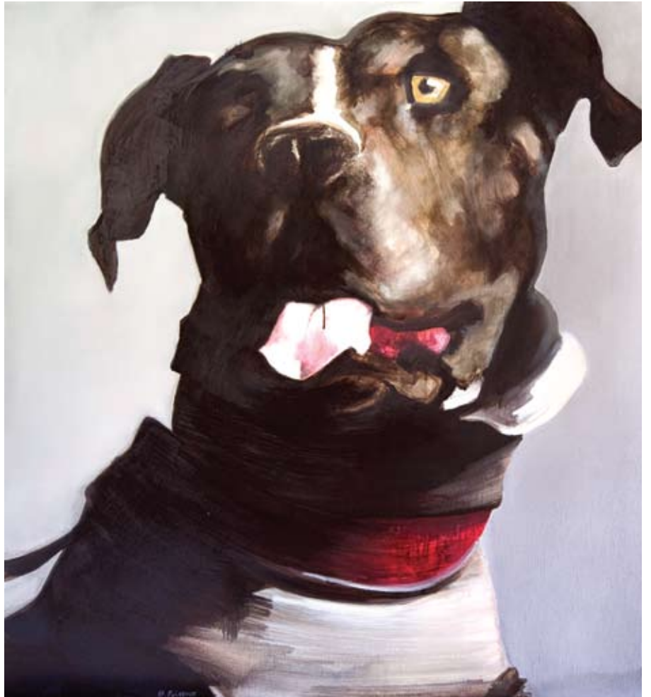
Go hard or go home 2009 oil over acrylic on board 120 x 110 cm