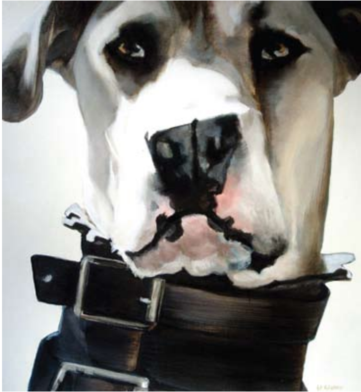
Who was fitted with collar and chain 2008 oil over acrylic on board 120 x 110 cm