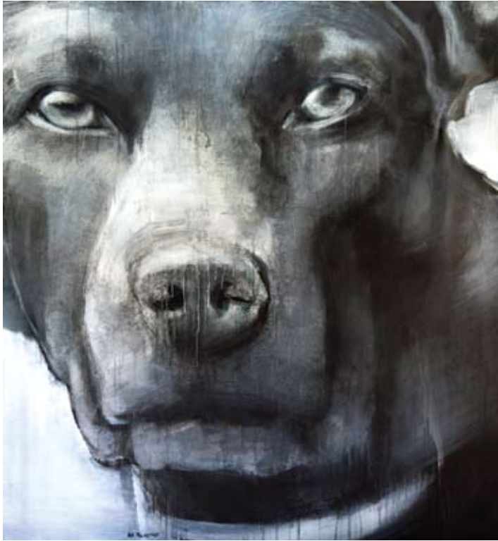
You come and go 2009 oil over acrylic on board 120 x 110 cm